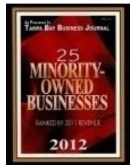
ONE OF THE 25 MINORITY BUSINESSES IN TAMPA BAY 2012

2030 State Road 60 East, Bartow, Florida 33830 – 863.533.9007 – fax 863.533.8997