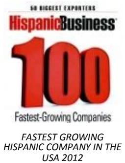
FASTEST GROWING HISPANIC COMPANY IN THE USA 2012