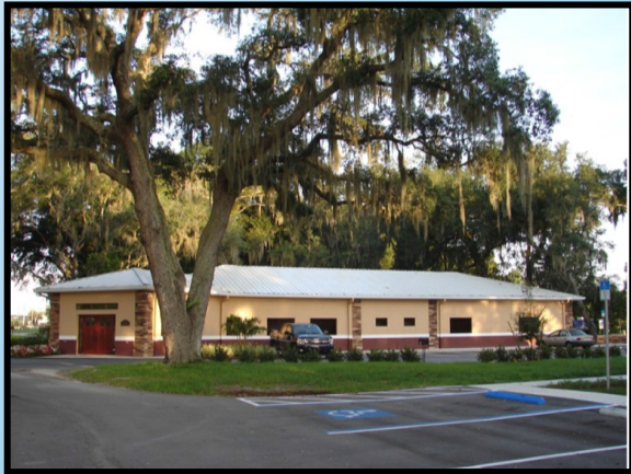
MEG's Net-zero energy main office building

We are a registered professional engineering (EB6509) and geological (GB459) consulting firm , centrally located in Bartow, serving throughout Florida.